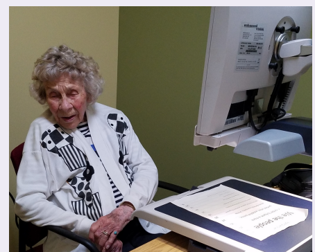
Image: A woman reads a document using magnifying technology.